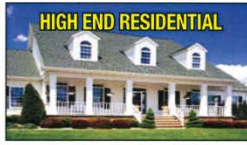
HIGH END RESIDENTIAL